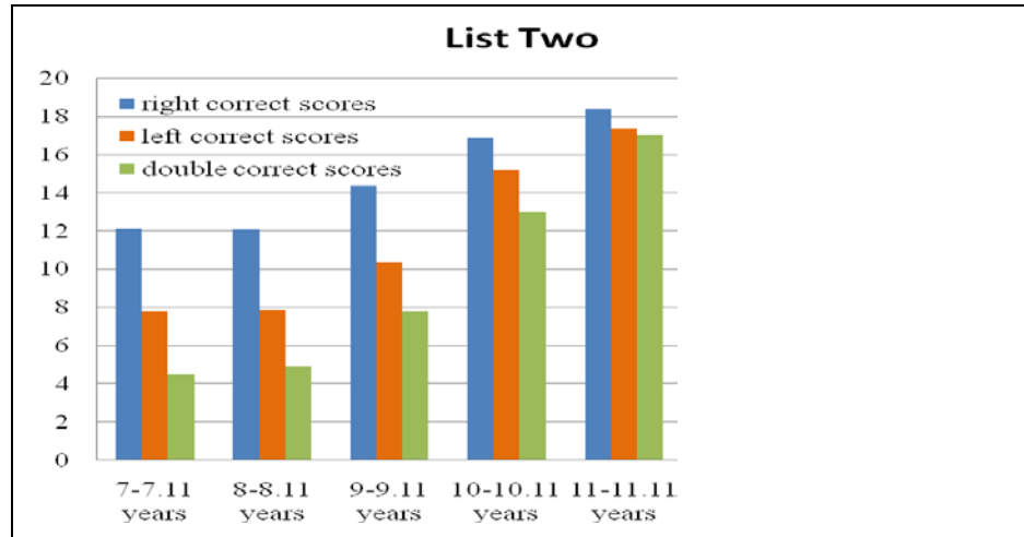
Graph 2: Mean right correct scores, left correct scores and double correct scores across the five age groups for list two.

Similar trend was found for the in list II as shown in Figure 2. The mean scores for single correct score and the double correct scores increases as age increases.