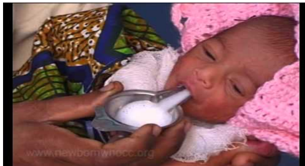
Figure 2.2: Feeding a neonate with paladai

The main objective of feeding is to acquire sufficient nutrients for optimum growth and development. Safe and effective feeding through oral modality in the neonates relies on appropriate development of sucking and swallowing along with breathing co-ordination. Further, normal feeding and swallowing are also dependent on structural integrity of the aero digestive system, neurological maturation along with social interaction and learning, which are influenced by sensory aspects such as oral sensation, motor aspects such as fine and gross motor development and other experimental opportunities. Any disruption to these normal aspects of feeding and swallowing development leads to dysphagia or feeding and swallowing difficulties.