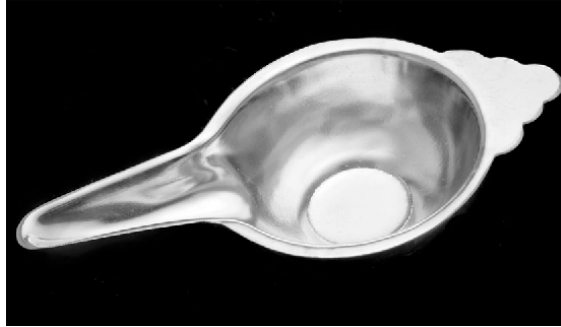
Figure 2.1: Paladai