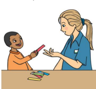
Speech Language Pathologist

If you suspect a voice disorder you should first consult a Speech Language Pathologist (SLP). After assessment SLP will recommend voice therapy or if the disorder can be treated with medication, you will be advised to consult an ENT doctor.