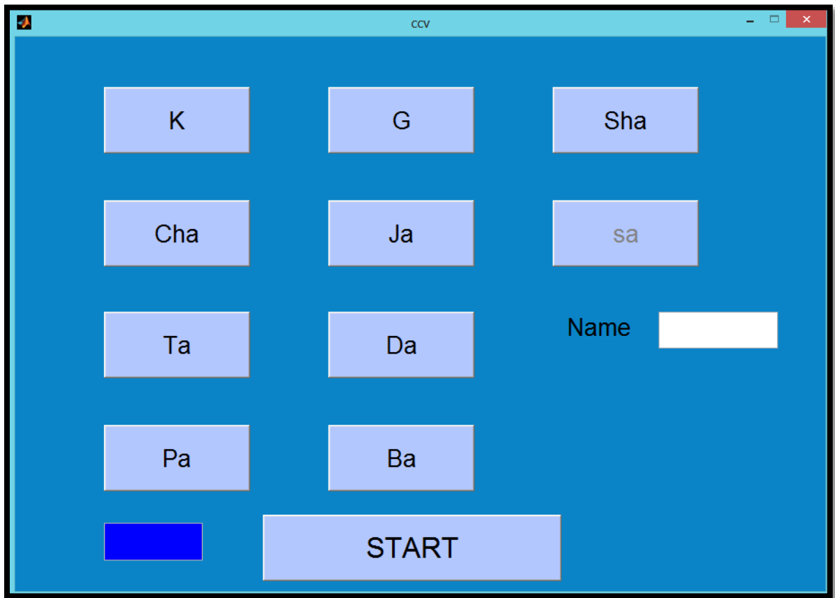
Figure 3.2 Snap shot of graphical user interface used in the study.