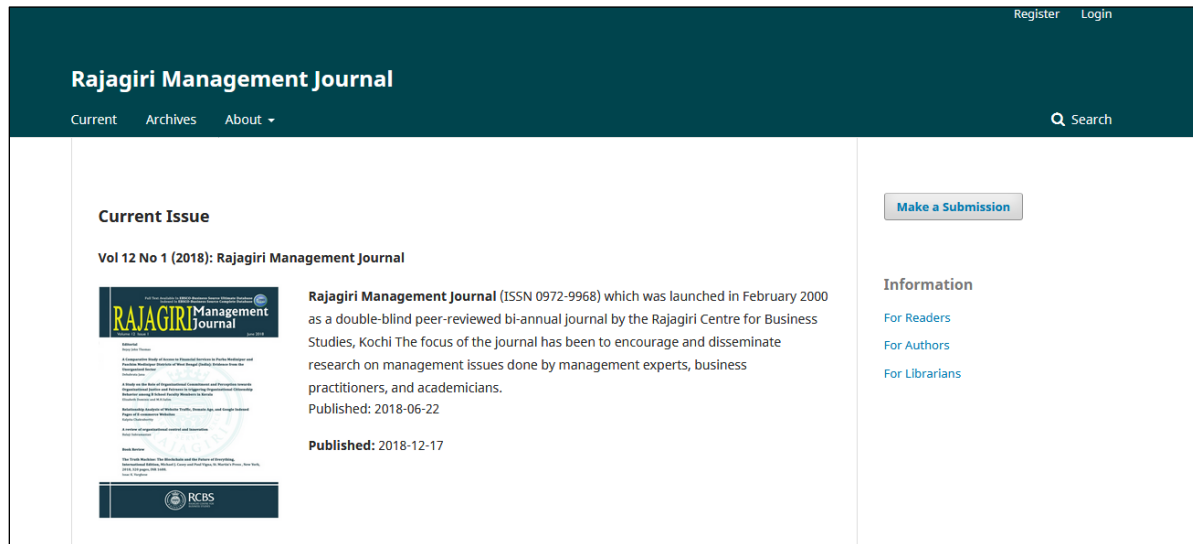
Figure 3: Rajagiri Management Journal – online

which provides managerial insights. The journal was indexed by EBSCO. ( http://journals.rajagiri.edu/index.php/rmj )