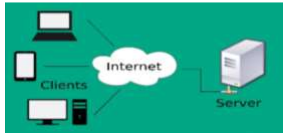
Figure 2. System Architecture