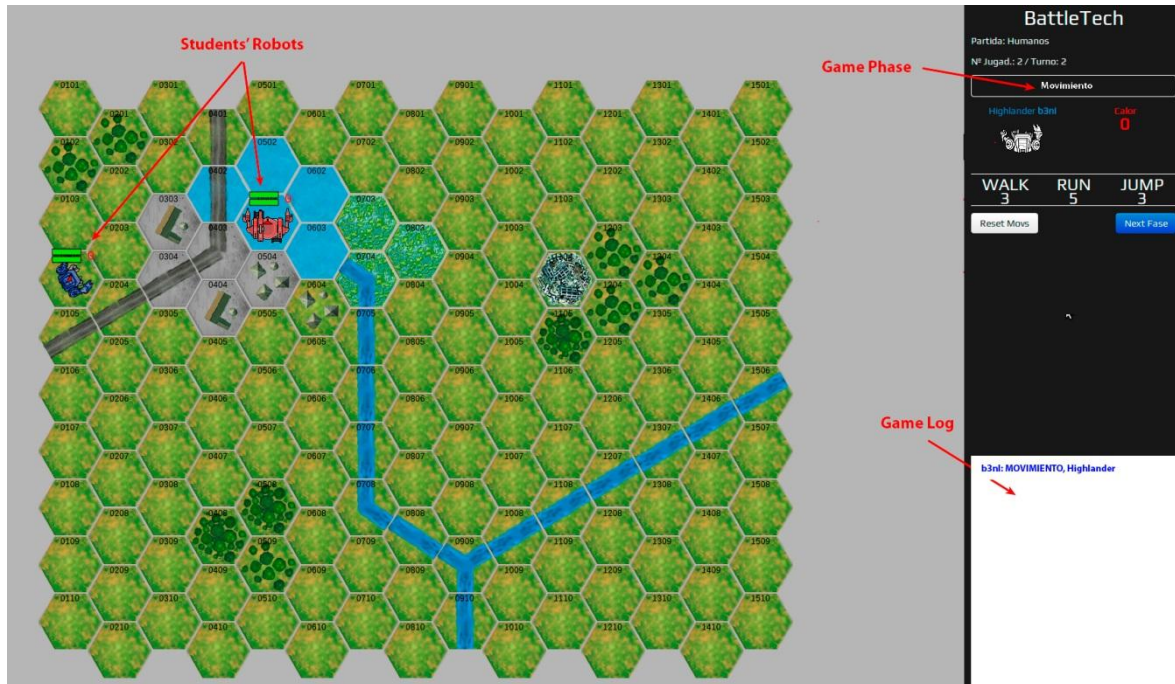
Figure 1. Screenshot showing the game board with trees, lakes and elevations, and two players' robots

In a detailed form, the operation within the system is described next.