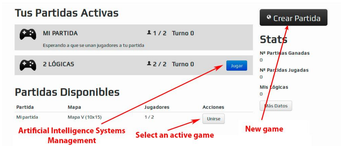
Figure 2. Game selection

When the students have their Artificial Intelligence Systems in advanced stages of development, they often begin to generate games with lots of players (open or closed) using the Artificial Intelligent Systems stored in the e-learning system.