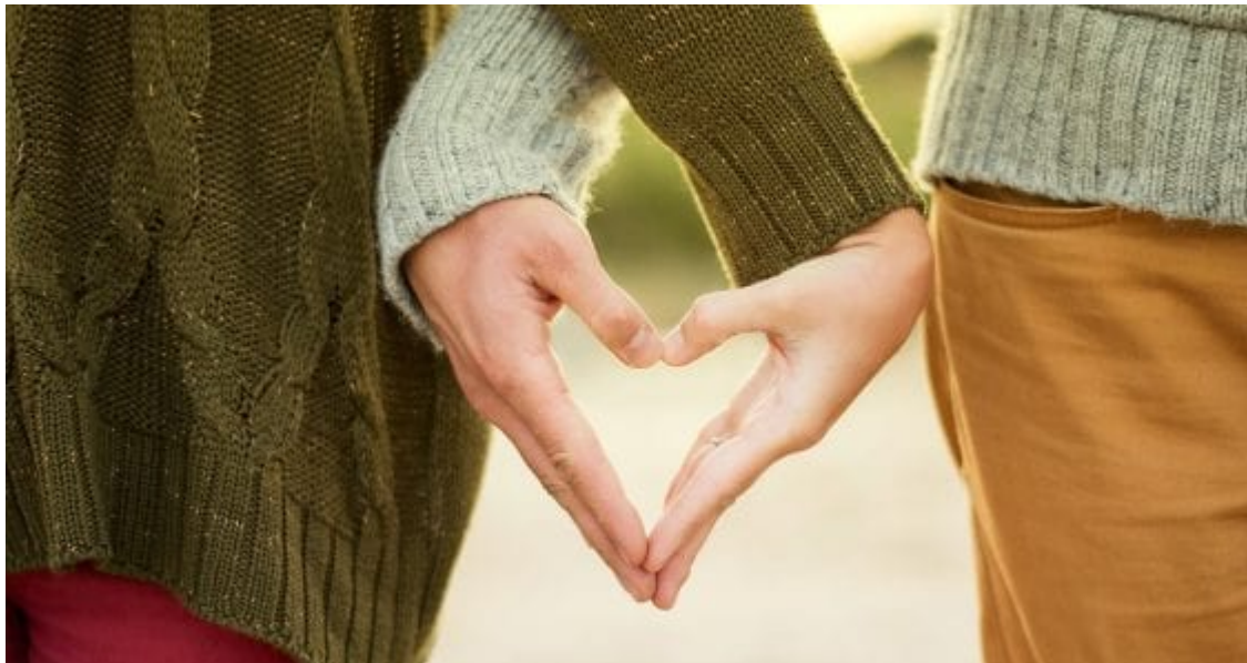
Improving society's sexual health ( https://news.curtin.edu.au/stories/improving-societys-sexual-health/ )