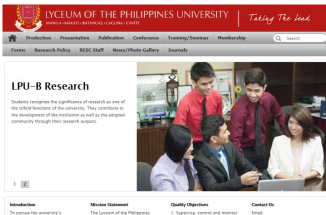
Figure 3: Institutional Research Home Page

The following figures presented in the discussion are sample of screen shots of the research web pages. The layout of the webpage is very similar to the University website for consistency of themes.