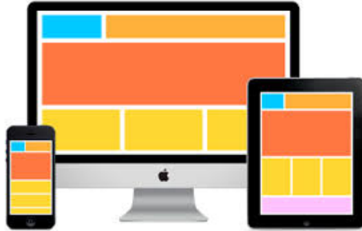
OJS3 is Responsive

OJS assists with every stage of the refereed publishing process, from submissions through to online publication and indexing. Through its management systems, its finely grained indexing of research, and the context it provides for research, OJS seeks to improve both the scholarly and public quality of refereed research. It's used by over 24,000 journals worldwide (although as registration is optional, the actual number is likely to be much higher)