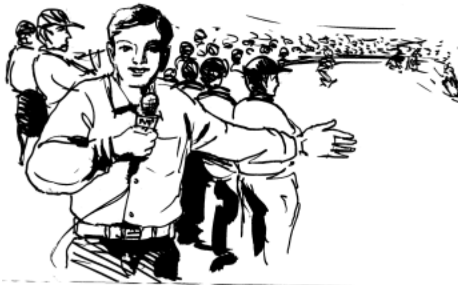
Fig.24.1: Reporting on a cricket match.

Those of you who gain some experience in the print media can think of joining the new media division of an established media organisation. These divisions are always on the lookout for good reporters, editors and writers. Reporters who work for new media not only pick up fresh story ideas for the web, but also follow up several important stories that have already appeared in the print edition.