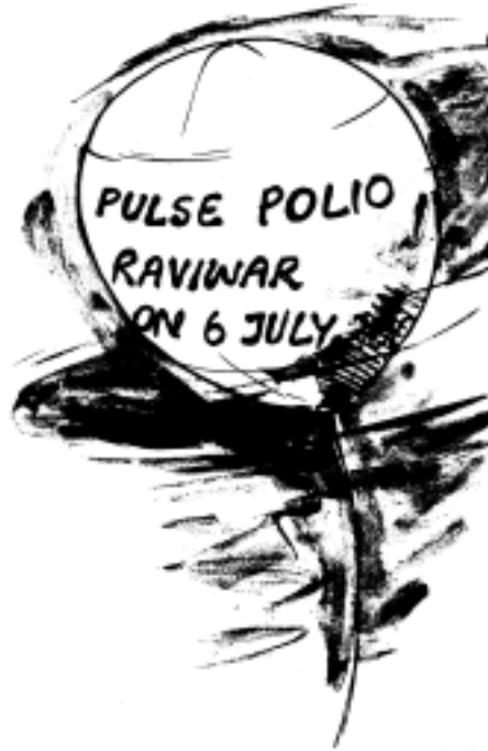
Fig. 20.3: Hot air balloon

However, you find that some forms of outdoor media such as hoardings erected on the roadside provide very little viewing time for the viewer and thus do not help in effective communication.