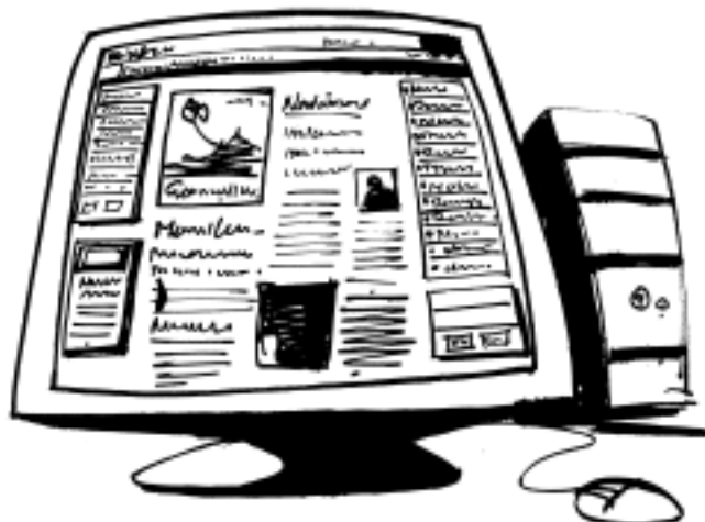
Fig. 20.4: Advertising through websites

The internet web is the most commonly used form of media for public relations.