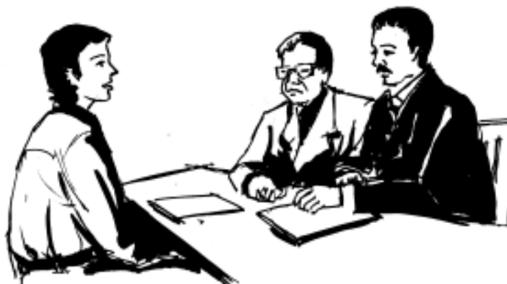
Fig. 20.2: Interview

the other answering them. The former is called an interviewer and the latter the interviewee. In this method, the interviewee gets an opportunity to impress the audience, fulfilling one of the goals of public relations.