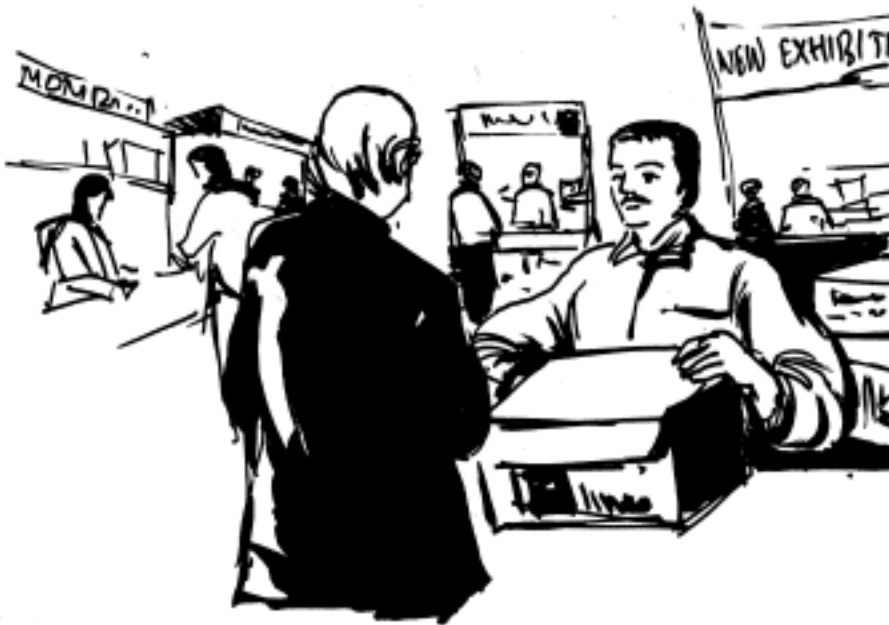
Fig. 20.5: Exhibition

Have you ever visited an exhibition? Then you would have seen several products being displayed and sold in a large space in an open area or in huge halls. You may have even bought a few items. You would also have come to know about several new products available in the market.