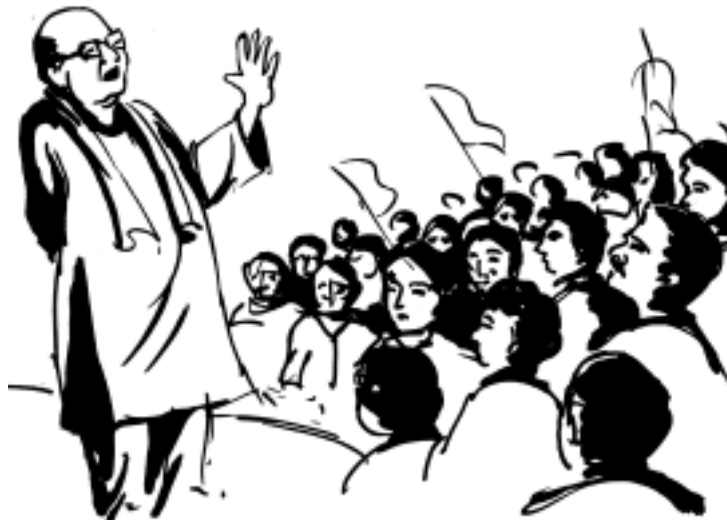
Fig. 20.1: Speech

This is an example of a speech which is a primary form of oral communication. A good speech helps in effectively communicating to the public. If the speech is delivered before a live audience, it provides an environment for a two-way communication.