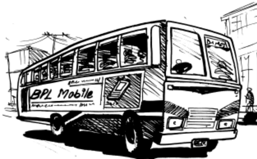
Fig. 20.4: Advertising on bus panels

However, you find that some forms of outdoor media such as hoardings erected on the roadside provide very little viewing time for the viewer and thus do not help in effective communication.