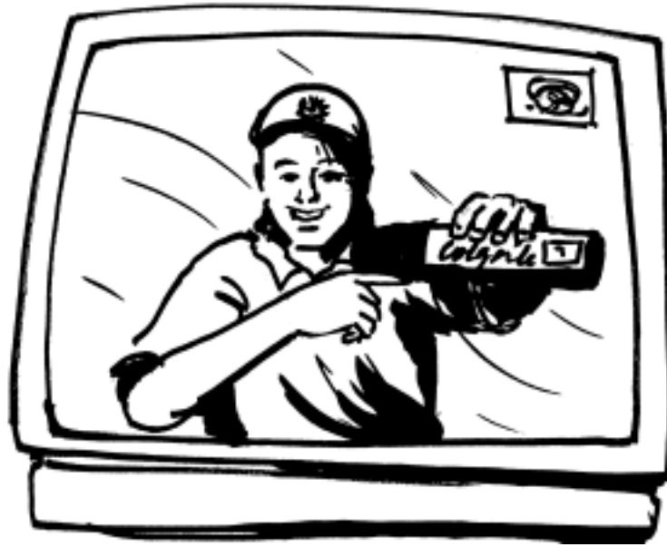
Fig. 18.2 : Product campaign