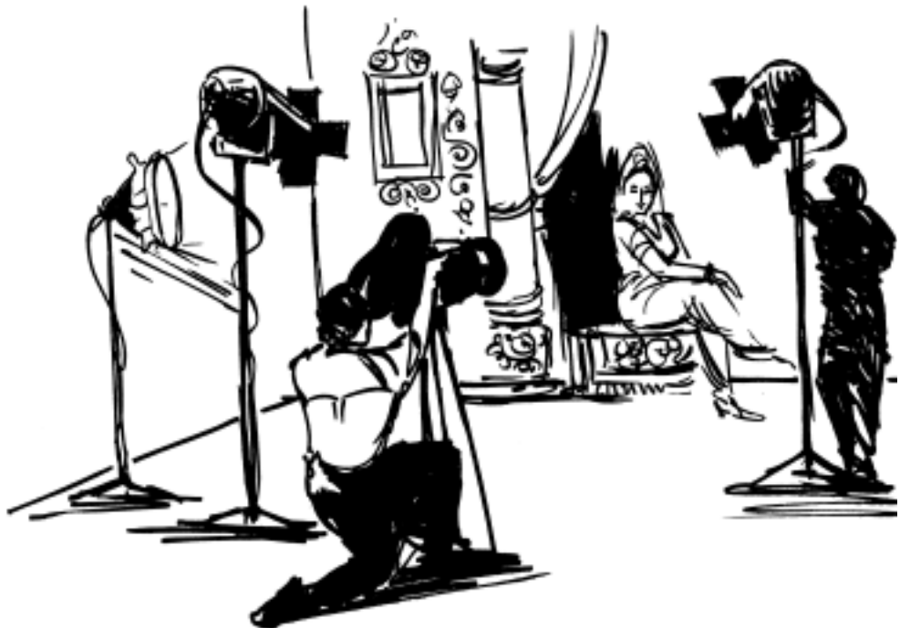
Fig. 16.10 : (a) Studio recording