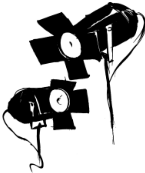
Fig. 16.5: Lights