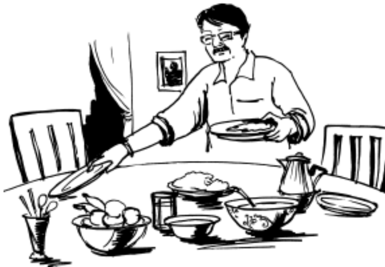
Fig. 16.1 (c)

Now imagine you have to produce a television programme. In a similar manner as above, you will first arrange everything required for the programme production. In the second stage you will actually carry on the production process, and thirdly you will polish the product for the final presentation on television. Thus, we can divide the entire production process into three major stages.