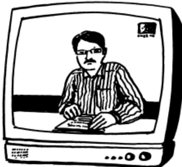
Fig. 16.8: Anchor

Who is your favourite anchor? Which programme does he/ she anchor?