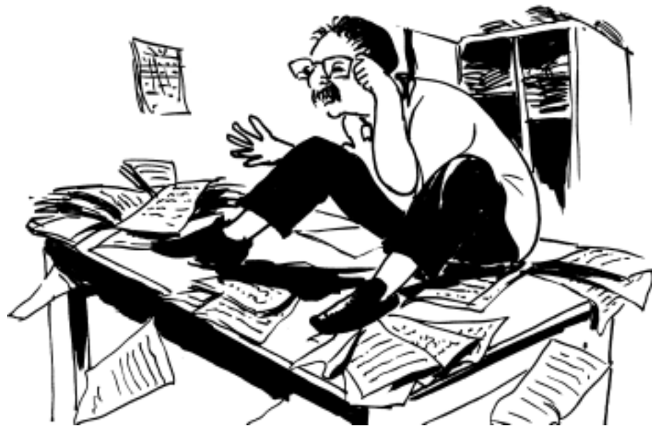
Fig. 16.3: Pre-production stage – getting ideas clear

In it involves planning everything in advance. This is very essential to get desired results. If you have all the raw ingredients ready in your kitchen, you can easily cook the food. Similarly, if you have worked well in this stage of programme production, the other two stages become easy and workable.