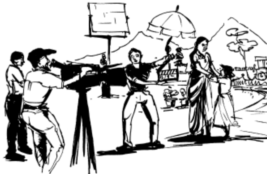
Fig. 16.10 : (b) Outdoor recording