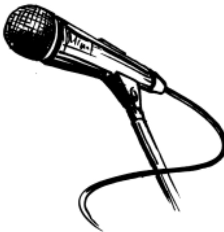
Fig. 16.6: Microphone

There are different types of microphones available for different purposes. Picking up a news anchor's voice, capturing the sounds of a tennis match, and recording a rock concert - all these require different types of microphones or a set of microphones.