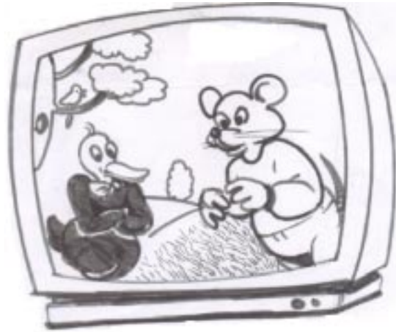
Fig. 15.4: Cartoon channel

Cartoon Network has also aired a few Indian-made cartoons, featuring ‘ Akbar and Birbal ’, ‘ Tenali Raman ’, ‘ Sindbad ’, ‘ Ramayan ’, ‘ Mahabharata ’ and ‘ Vikram and Betal ’.