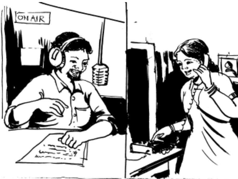
Fig. 11.1: Phone-in programme