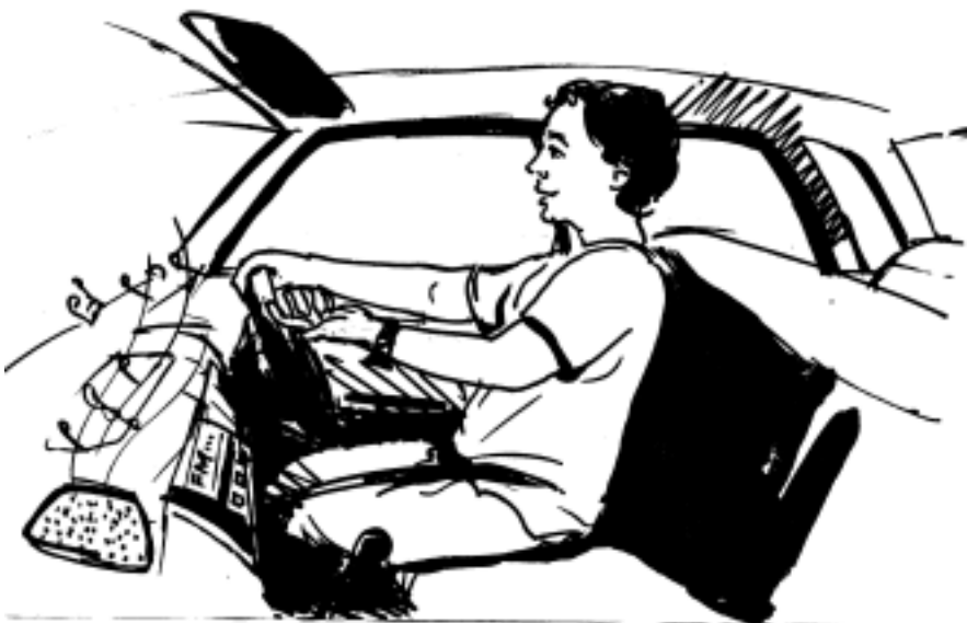
Fig. 9.3: Listening to music while driving