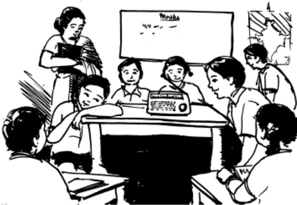
Fig. 9.2: Students listening to an educational programme on radio

Radio stations broadcast film songs. Don't you tune into film songs on radio for entertainment? Even the casual comments and announcements on radio entertain us.