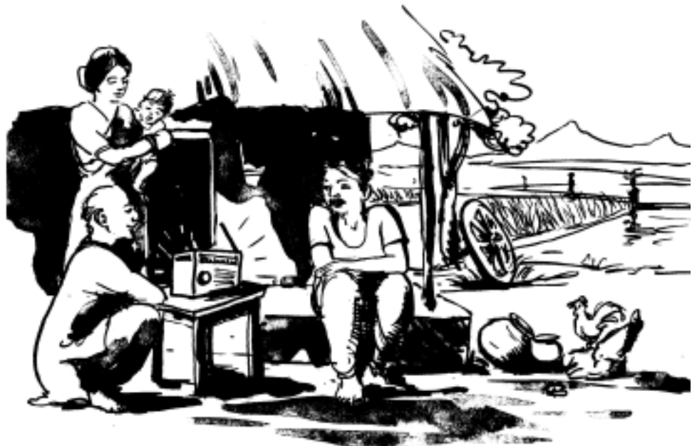
Fig. 9.1: Listening to radio in a rural setting