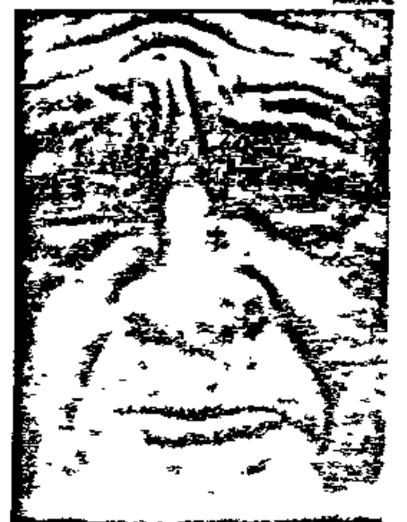
Israeli Likud leader Ariel Sharon grimaces as he visits an army outpost along the Israel-Jordan border on Wednesday.