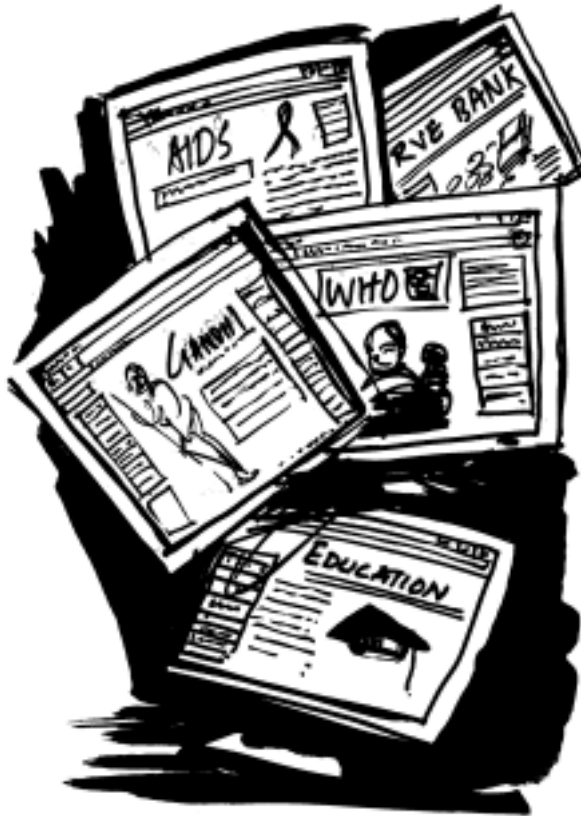
Fig. 21.3: Websites

Now, in a country like India, where there are so many villages, how many people have access to the computer? And, if they cannot use computers, then what's the use of new media?