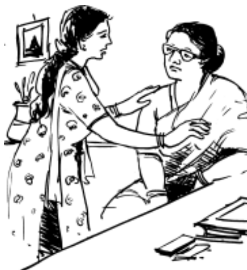
Fig. 21.2 : Anjali trying to convince Mrs Madhavan

Anjali smiles and holds Mrs Madhavan's hand. "Don't worry aunty. I will talk to Aditya. I am sure he knows what he's doing."