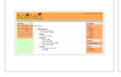
2 column Front Page, blocks left

3 column Front Page, topic checked 2 column Front Page, blocks right