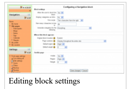
Editing block settings

Some components of the Main Page, such as the logo, heading and Navigation bar may be changed by an administrator in Themes in the Site administration and clicking on the theme name. Different themes may have fewer or more options to set. There are some other settings available in 'Theme settings'.