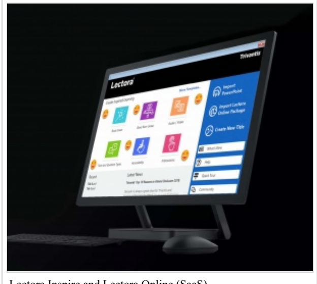
Lectora Inspire and Lectora Online (SaaS)

Note: Also includes Camtasia, SnagIt, eLearning Brothers and BranchTrack Integration.