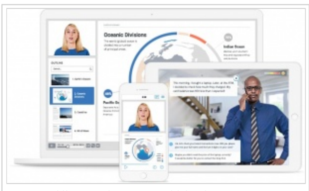
Create mobile eLearning courses with iSpring