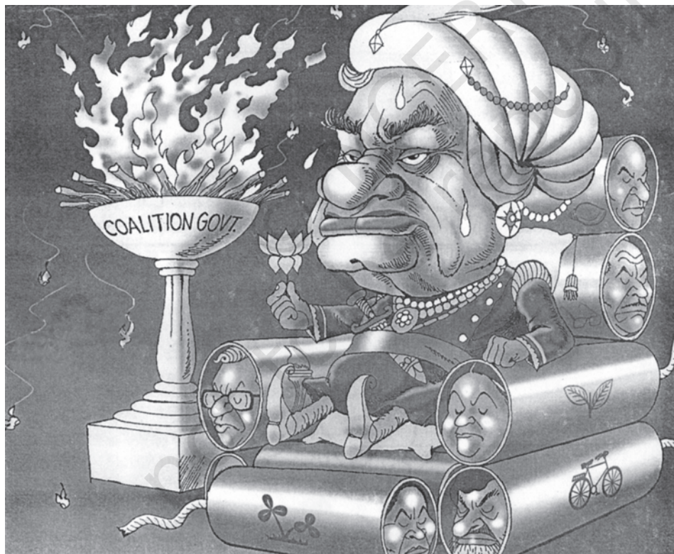
© Ajith Niman - India Today Book of Cartoons

Here are two cartoons showing the relationship between Centre and States. Should the State go to the Centre with a begging bowl? How can the leader of a coalition keep the partners of government satisfied?