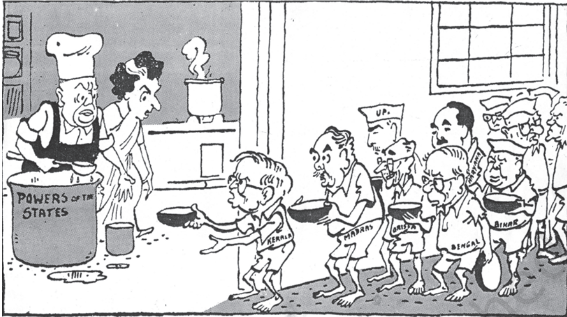
© Kutty - Laughing with Kutty