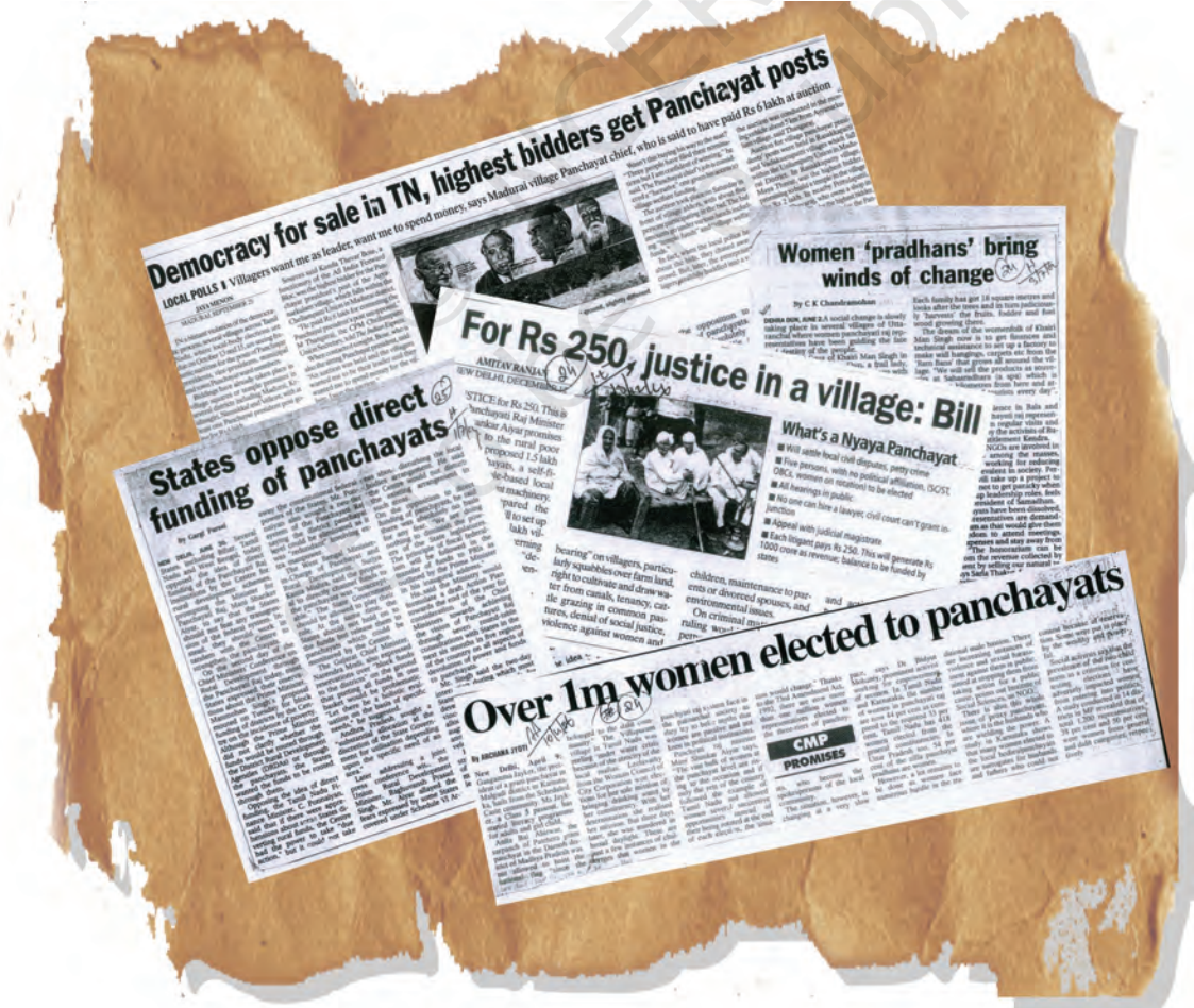
What do these newspaper clippings have to say about efforts of decentralisation in India?

Prime Minister runs the country. Chief Minister runs the state. Logically, then, the chairperson of Zilla Parishad should run the district. Why does the D.M. or Collector administer the district?