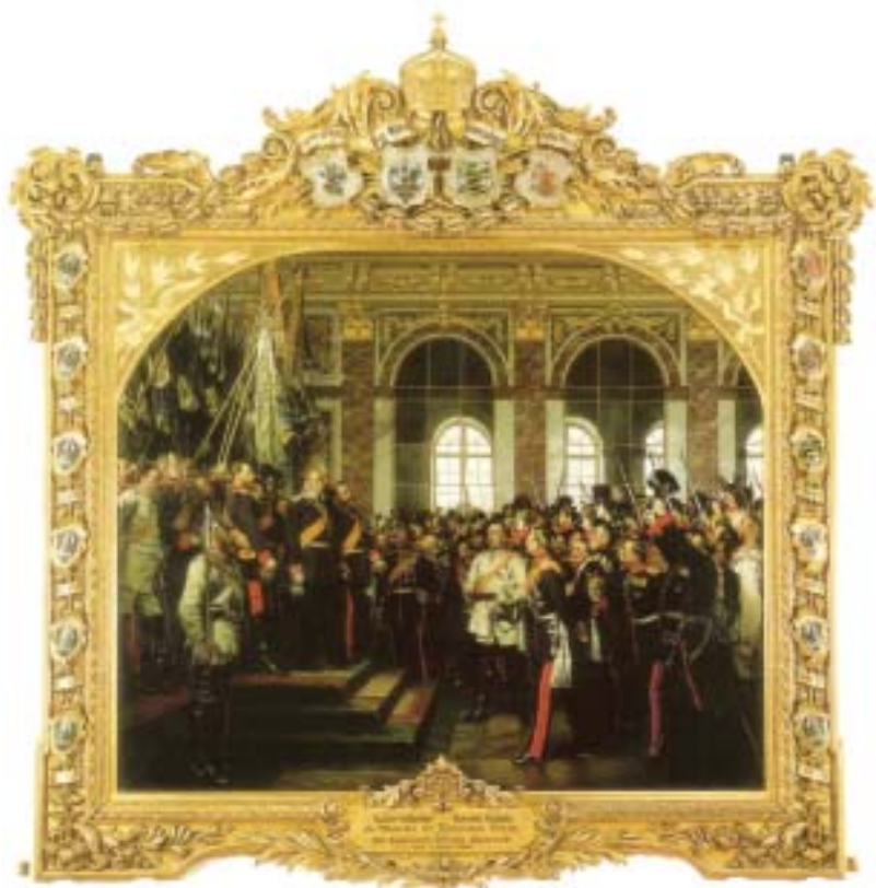
Fig. 11 – The proclamation of the German empire in the Hall of Mirrors at Versailles, Anton von Werner. At the centre stands the Kaiser and the chief commander of the Prussian army, General von Roon. Near them is Bismarck. This monumental work (2.7m x 2.7m) was completed and presented by the artist to Bismarck on the latter's 70th birthday in 1885.

The nation-building process in Germany had demonstrated the dominance of Prussian state power. The new state placed a strong emphasis on modernising the currency, banking, legal and judicial systems in Germany. Prussian measures and practices often became a model for the rest of Germany.