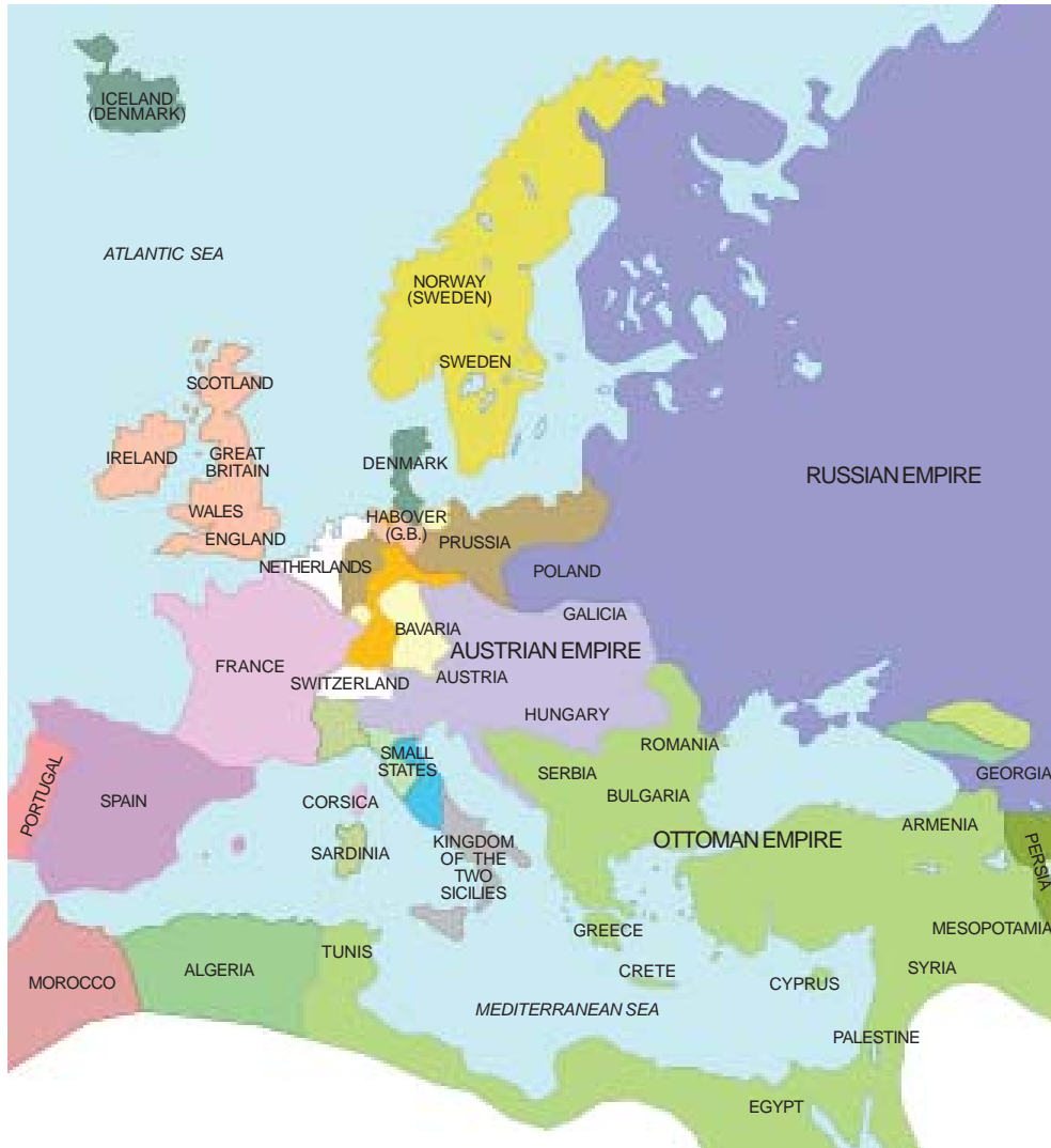
Fig. 3 – Europe after the Congress of Vienna, 1815.

Within the wide swathe of territory that came under his control, Napoleon set about introducing many of the reforms that he had already introduced in France. Through a return to monarchy Napoleon had, no doubt, destroyed democracy in France, but in the administrative field he had incorporated revolutionary principles in order to make the whole system more rational and efficient. The Civil Code of 1804 – usually known as the Napoleonic Code – did away with all privileges based on birth, established equality before the law and secured the right to property. This Code was exported to the regions under French control. In the Dutch Republic, in Switzerland, in Italy and Germany, Napoleon simplified administrative divisions, abolished the feudal system and freed peasants from serfdom and manorial dues. In the towns too, guild restrictions were removed. Transport and communication systems were improved. Peasants, artisans, workers and new businessmen