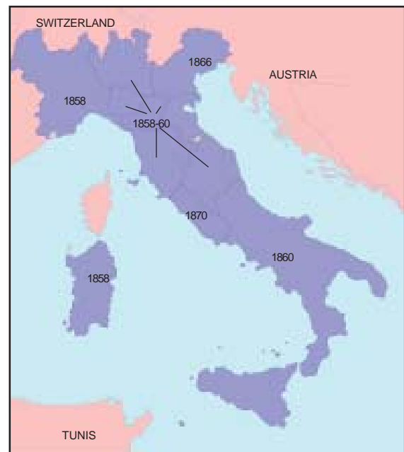
Fig. 14(b) — Italy after unification. The map shows the year in which different regions (seen in Fig 14(a)) become part of a unified Italy.