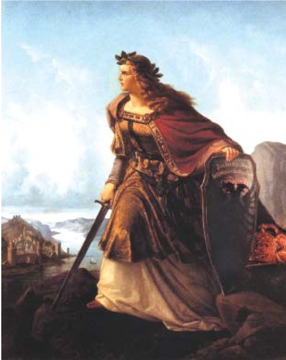
Fig. 19 – Germania guarding the Rhine.

In 1860, the artist Lorenz Clasen was commissioned to paint this image. The inscription on Germania's sword reads: 'The German sword protects the German Rhine.'