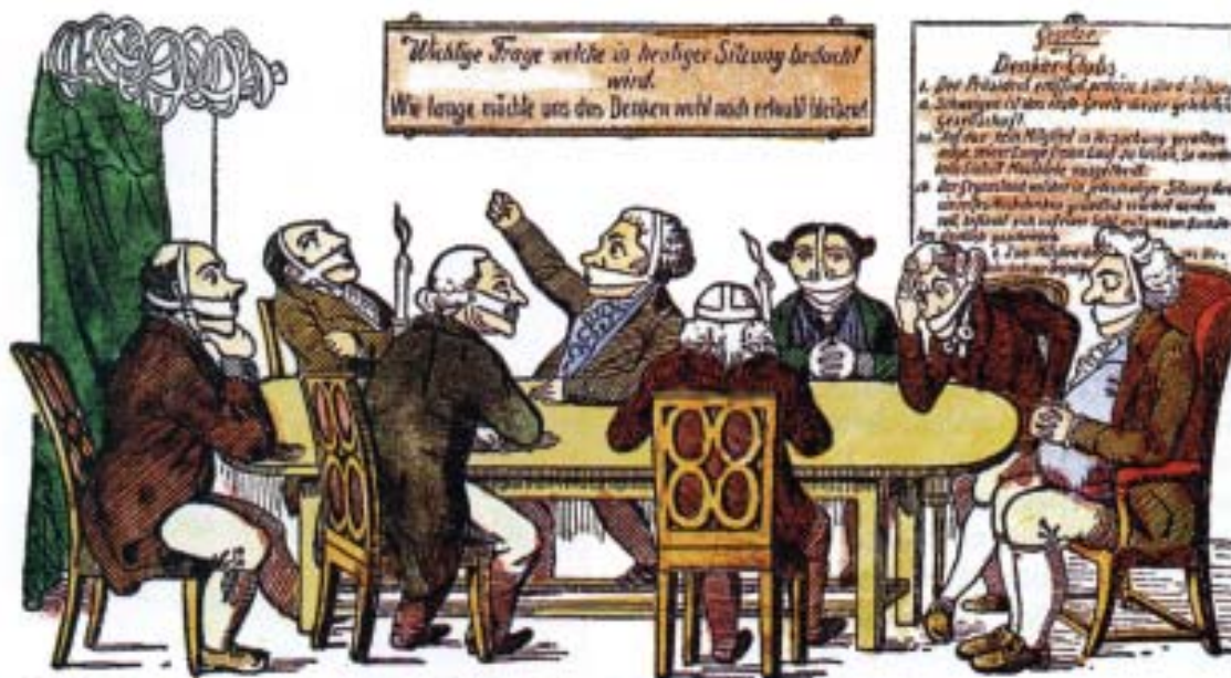
Fig. 6 – The Club of Thinkers, anonymous caricature dating to c. 1820.

What is the caricaturist trying to depict?