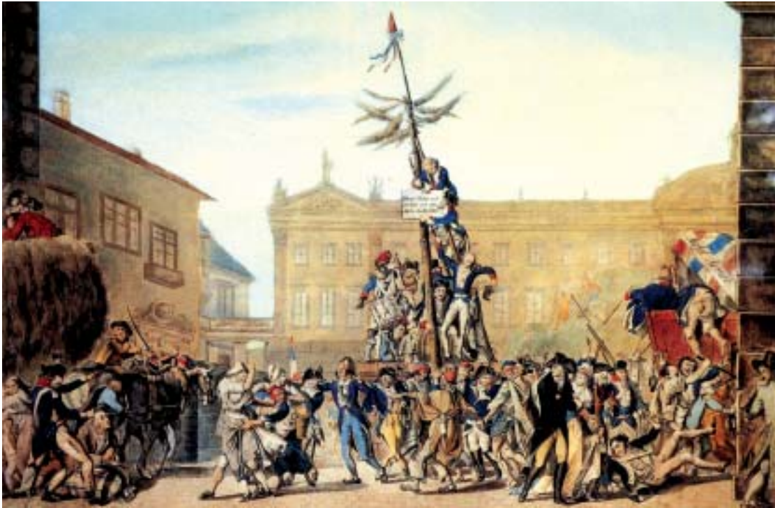
Fig. 4 – The Planting of Tree of Liberty in Zweibrücken, Germany. The subject of this colour print by the German painter Karl Kaspar Fritz is the occupation of the town of Zweibrücken by the French armies. French soldiers, recognisable by their blue, white and red uniforms, have been portrayed as oppressors as they seize a peasant's cart (left), harass some young women (centre foreground) and force a peasant down to his knees. The plaque being affixed to the Tree of Liberty carries a German inscription which in translation reads: 'Take freedom and equality from us, the model of humanity.' This is a sarcastic reference to the claim of the French as being liberators who opposed monarchy in the territories they entered.

enjoyed a new-found freedom. Businessmen and small-scale producers of goods, in particular, began to realise that uniform laws, standardised weights and measures, and a common national currency would facilitate the movement and exchange of goods and capital from one region to another.