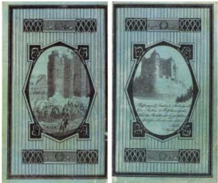
Fig. 2 — The cover of a German almanac designed by the journalist Andreas Rebmann in 1798.

When the news of the events in France reached the different cities of Europe, students and other members of educated middle classes began setting up Jacobin clubs. Their activities and campaigns prepared the way for the French armies which moved into Holland, Belgium, Switzerland and much of Italy in the 1790s. With the outbreak of the revolutionary wars, the French armies began to carry the idea of nationalism abroad.