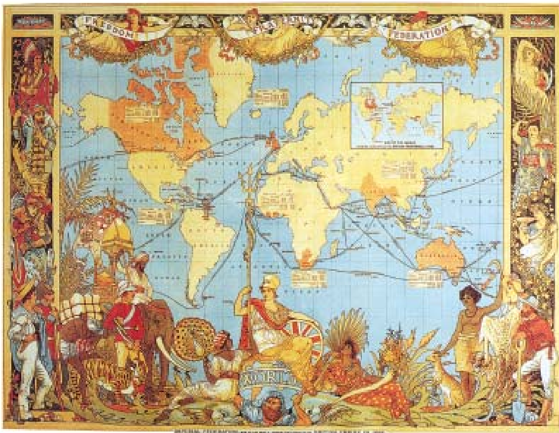
Fig. 20 – A map celebrating the British Empire.

At the top, angels are shown carrying the banner of freedom. In the foreground, Britannia – the symbol of the British nation – is triumphantly sitting over the globe. The colonies are represented through images of tigers, elephants, forests and primitive people. The domination of the world is shown as the basis of Britain's national pride.