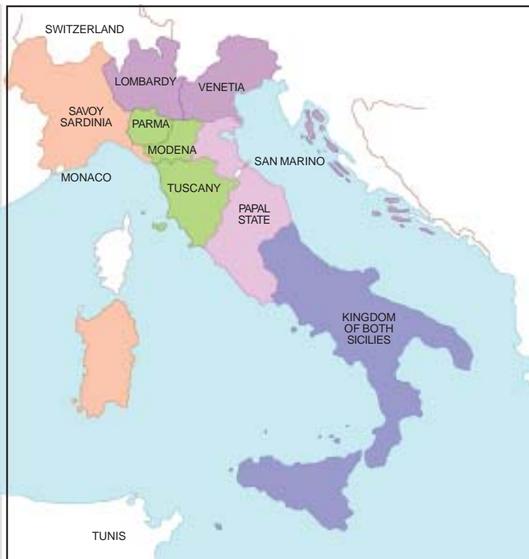
Fig. 14(a) — Italian states before unification, 1858.

Examine Fig. 14(b). Which was the first region to become a part of unified Italy? Which was the last region to join? In which year did the largest number of states join?