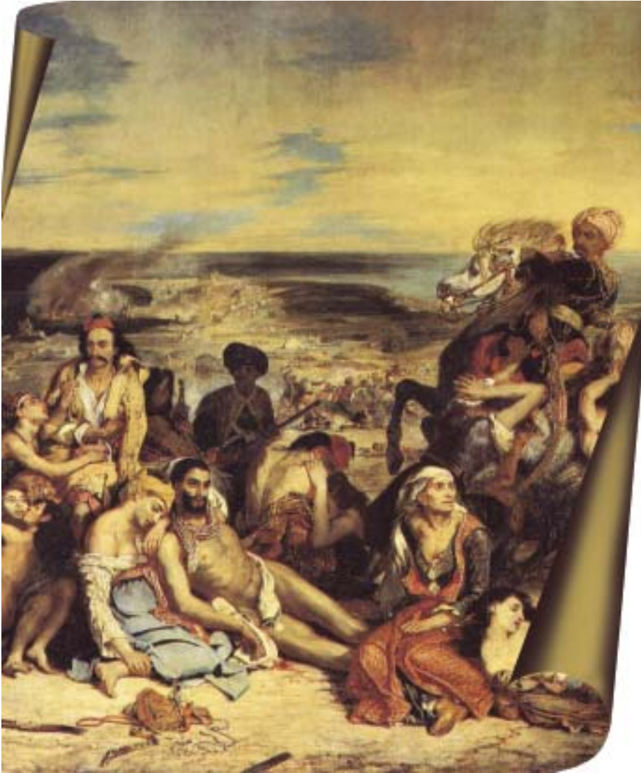
Fig. 8 — The Massacre at Chios, Eugene Delacroix, 1824.

The French painter Delacroix was one of the most important French Romantic painters. This huge painting (4.19m x 3.54m) depicts an incident in which 20,000 Greeks were said to have been killed by Turks on the island of Chios. By dramatising the incident, focusing on the suffering of women and children, and using vivid colours, Delacroix sought to appeal to the emotions of the spectators, and create sympathy for the Greeks.