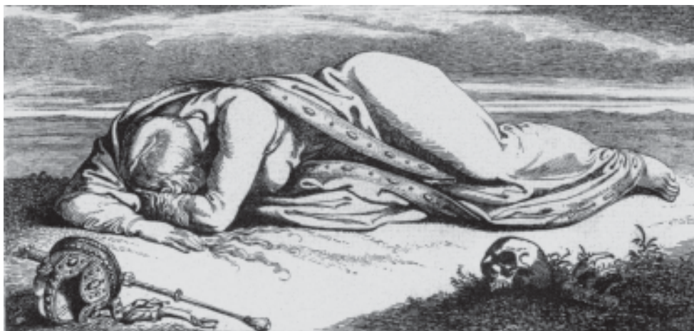
Fig. 18 – The fallen Germania , Julius Hübner, 1850.