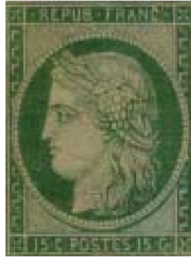
Fig. 16 – Postage stamps of 1850 with the figure of Marianne representing the Republic of France.

Allegory – When an abstract idea (for instance, greed, envy, freedom, liberty) is expressed through a person or a thing. An allegorical story has two meanings, one literal and one symbolic