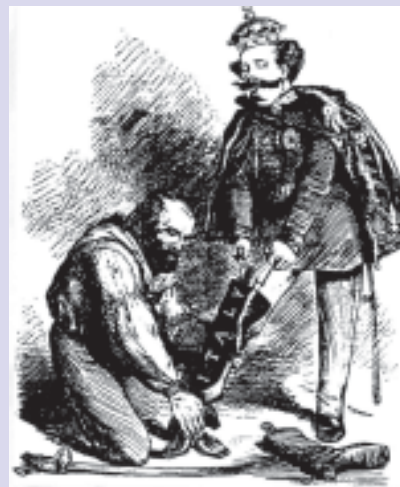
Fig. 15 – Garibaldi helping King Victor Emmanuel II of Sardinia-Piedmont to pull on the boot named ‘Italy’. English caricature of 1859.

In 1867, Garibaldi led an army of volunteers to Rome to fight the last obstacle to the unification of Italy, the Papal States where a French garrison was stationed. The Red Shirts proved to be no match for the combined French and Papal troops. It was only in 1870 when, during the war with Prussia, France withdrew its troops from Rome that the Papal States were finally joined to Italy.