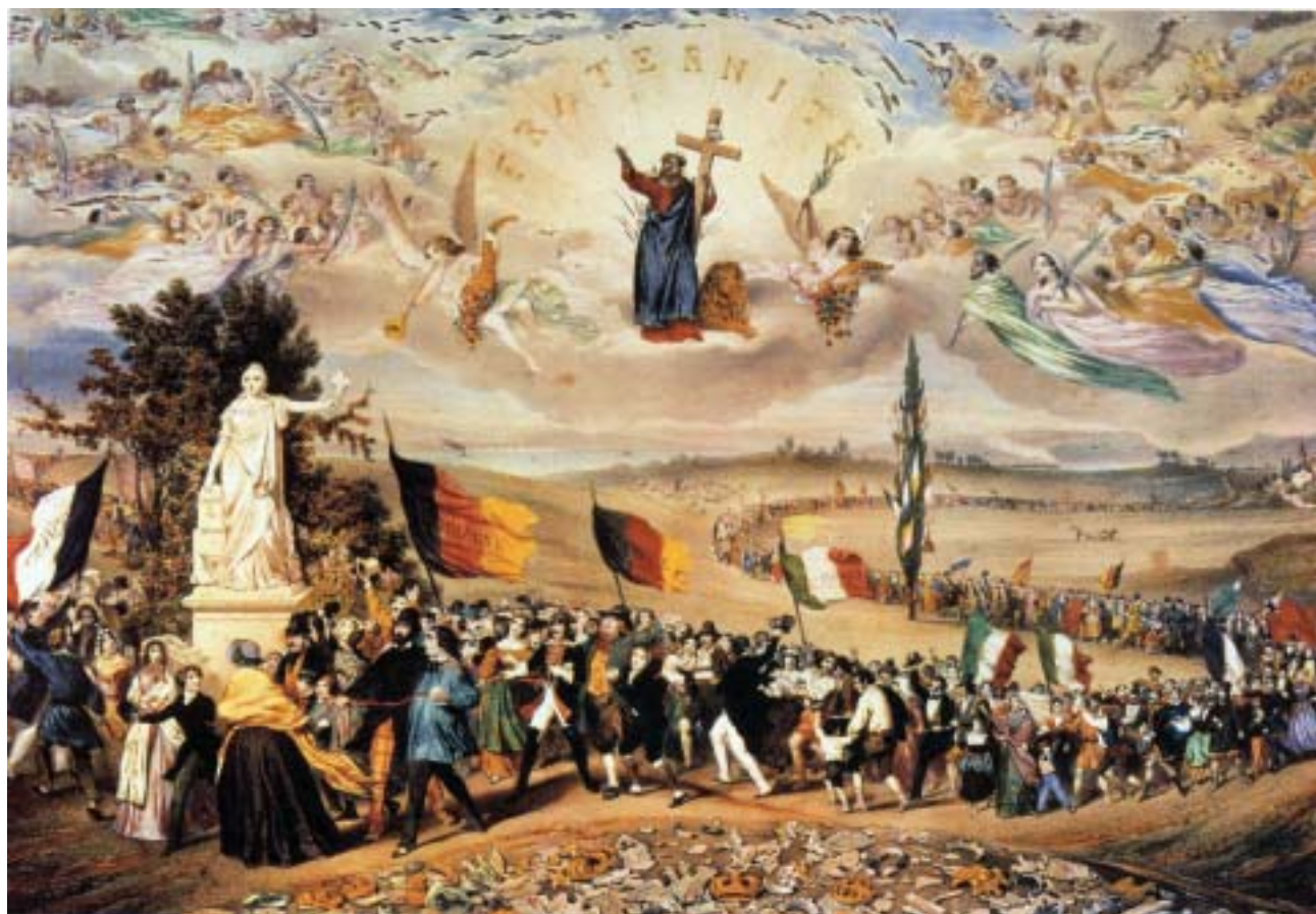
Fig. 1 – The Dream of Worldwide Democratic and Social Republics – The Pact Between Nations, a print prepared by Frédéric Sorrieu, 1848.

In 1848, Frédéric Sorrieu, a French artist, prepared a series of four prints visualising his dream of a world made up of ‘democratic and social Republics’, as he called them. The first print (Fig. 1) of the series, shows the peoples of Europe and America – men and women of all ages and social classes – marching in a long train, and offering homage to the statue of Liberty as they pass by it. As you would recall, artists of the time of the French Revolution personified Liberty as a female figure – here you can recognise the torch of Enlightenment she bears in one hand and the Charter of the Rights of Man in the other. On the earth in the foreground of the image lie the shattered remains of the symbols of absolutist institutions . In Sorrieu’s utopian vision, the peoples of the world are grouped as distinct nations, identified through their flags and national costume. Leading the procession, way past the statue of Liberty, are the United States and Switzerland , which by this time were already nation-states. France,