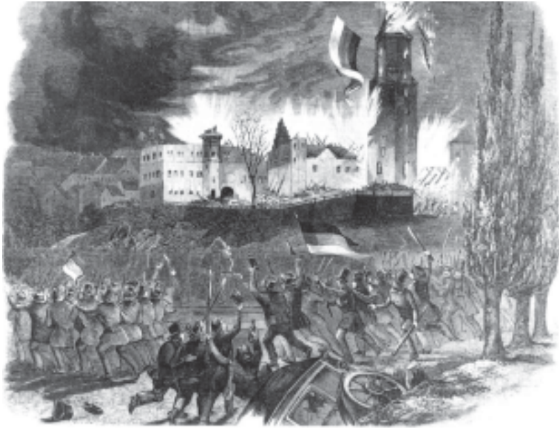
Fig. 9 – Peasants' uprising, 1848.

National Assembly proclaimed a Republic, granted suffrage to all adult males above 21, and guaranteed the right to work. National workshops to provide employment were set up.