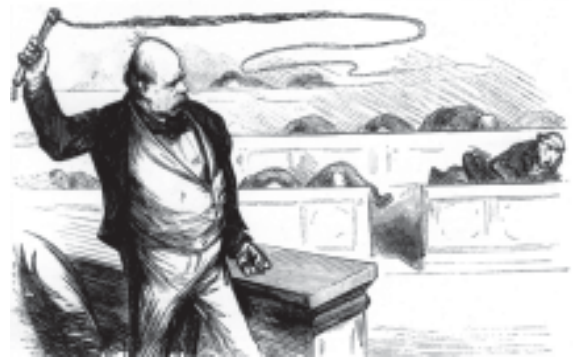
Fig. 13 – Caricature of Otto von Bismarck in the German reichstag (parliament), from Figaro, Vienna, 5 March 1870.

During the 1830s, Giuseppe Mazzini had sought to put together a coherent programme for a unitary Italian Republic. He had also formed a secret society called Young Italy for the dissemination of his goals. The failure of revolutionary uprisings both in 1831 and 1848 meant that the mantle now fell on Sardinia-Piedmont under its ruler King Victor Emmanuel II to unify the Italian states through war. In the eyes of the ruling elites of this region, a unified Italy offered them the possibility of economic development and political dominance.