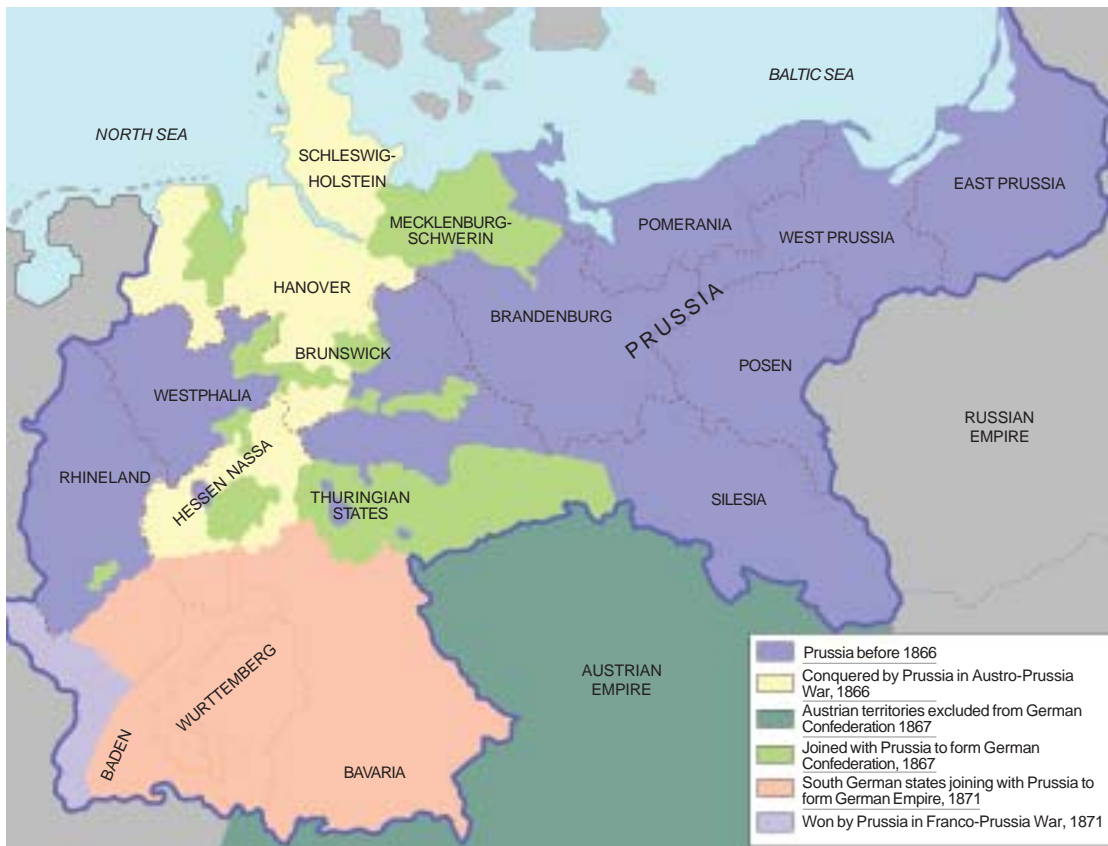
Fig. 12 – Unification of Germany (1866-71).