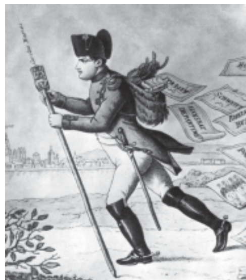
Fig. 5 – The courier of Rhineland loses all that he has on his way home from Leipzig. Napoleon here is represented as a postman on his way back to France after he lost the battle of Leipzig in 1813. Each letter dropping out of his bag bears the names of the territories he lost.

However, in the areas conquered, the reactions of the local populations to French rule were mixed. Initially, in many places such as Holland and Switzerland, as well as in certain cities like Brussels, Mainz, Milan and Warsaw, the French armies were welcomed as harbingers of liberty. But the initial enthusiasm soon turned to hostility, as it became clear that the new administrative arrangements did not go hand in hand with political freedom. Increased taxation, censorship, forced conscription into the French armies required to conquer the rest of Europe, all seemed to outweigh the advantages of the administrative changes.