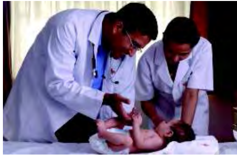
Most babies do not get basic health care

The problem does not end with Infant Mortality Rate. The last column of table 1.4 shows around two-thirds of children aged 14-15 in Bihar are not attending school beyond Class 8. This means that if you went to school in Bihar more than two-thirds of your class would be missing. Those who could have been in school are not there! If this had happened to you, you would not be able to read what you are reading now.