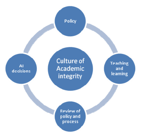
Figure 1: Aligning policy and practice in a culture of academic integrity (extending East, 2009).

This paper responds to the policy aspect in Figure 1 above and reports on the findings from an analysis of Australian universities' academic integrity policies.