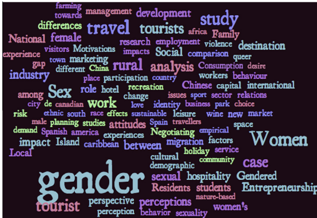
Fig. 2. The most popular words in titles of indexed tourism gender research papers, 1985–2012.