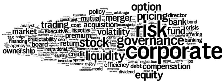
Fig. 1. Word Cloud of Most Commonly Used Keywords in JOD over 1996-2015.

Fig. 1 depicts the 300 most commonly stated keywords of publications in finance journals classified as JOD by the 2015 ABS list, weighted by their number of occurrences over the period 1996 to 2015.