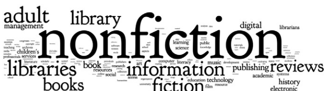
Fig. 3. Non-research keyword word cloud.

A possible future study could include a parallel comparison of future periodicals. As Feehan et al. (1987) suggest, this study could lay the