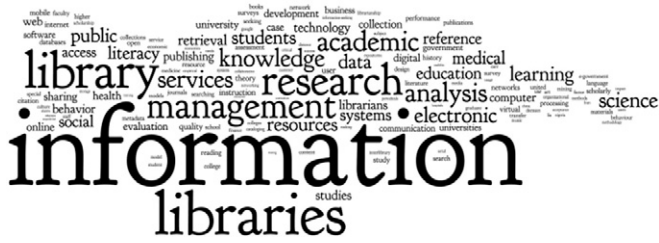
Fig. 2. Research keyword word cloud.

analysis. One aspect of this includes the ongoing challenges of maintaining records of an increasingly digital collection. While the majority of the journal titles subscribed to as part of the LIS collection are still available in print and cataloged to reflect this, searches in the catalog, the integrated library system, and vendor platforms yielded inconsistent results.