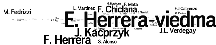
Fig. 4. Top cited authors.

On the one hand, to obtain the most relevant papers about soft consensus models in a fuzzy environment, we identify in Table 3 the top ten cited papers in this research topic. Most of these papers proposed original consensus models which contained the seeds for future development, that is, they presented new and original ideas that turned out to be the foundation of very important future developments, and, therefore, they have received a high number of citations.