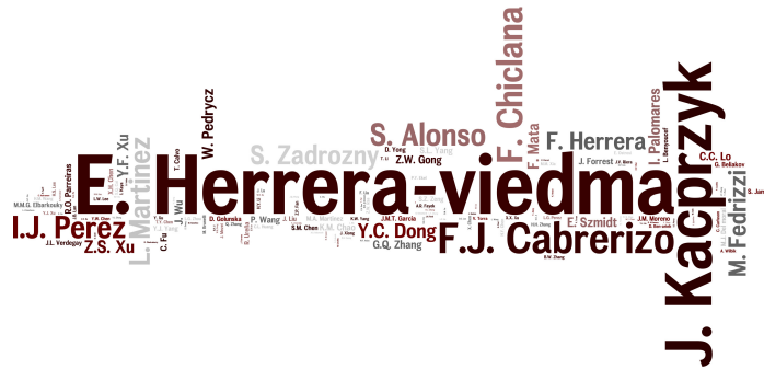
Fig. 2. Contributing authors.

The quantitative measures of authors and their countries of affiliation are displayed in Figure 2 and Table 1, respectively. On the one hand, Table 1 shows the top ten countries of affiliation of the authors. From this table, we can observe that the People's Republic of China and United Kingdom have published a high number of papers. They together with Spain and Poland, are the four countries that more have contributed to the field of soft consensus approaches in a fuzzy environment.