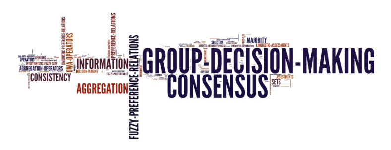
Fig. 3. Main topics cited in keywords.

them together. We use a tag cloud representation to show the results of this analysis over the stems, proportionally to their frequency (see Figure 3). We observe that, naturally, "consensus" and "group-decision-making" are the most important keywords, as the consensus processes are mainly used in GDM problems. But it is remarkable how other related terms have a strong importance. Some of them are mainly related to the structure in which the decision makers express their preferences ("preference-relations", "fuzzy-preference-relations", "linguisticpreference-relations") and others are related with the aggregation of the opinions expressed by the decision makers ("aggregation", "aggregation-operators", "owa-operators").