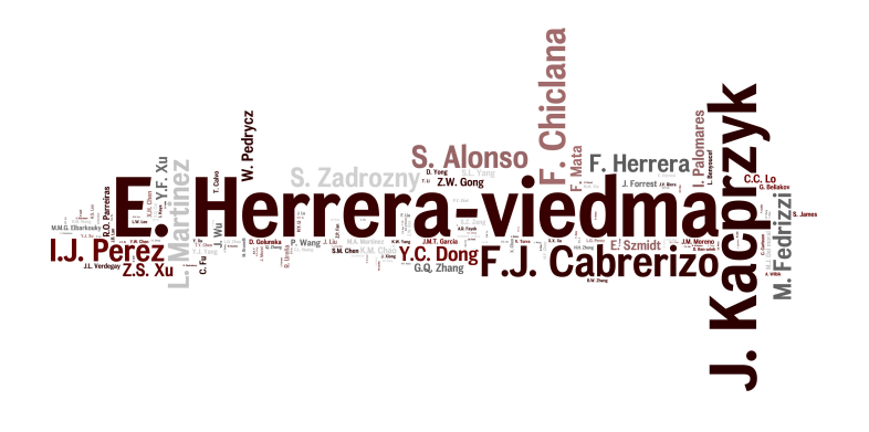
Fig. 2. Contributing authors.

The quantitative measures of authors and their countries of affiliation are displayed in Figure 2 and Table 1, respectively. On the one hand, Table 1 shows the top ten countries of affiliation of the authors. From this table, we can observe that the People's Republic of China and United Kingdom have published a high number of papers. They together with Spain and Poland, are the four countries that more have contributed to the field of soft consensus approaches in a fuzzy environment.