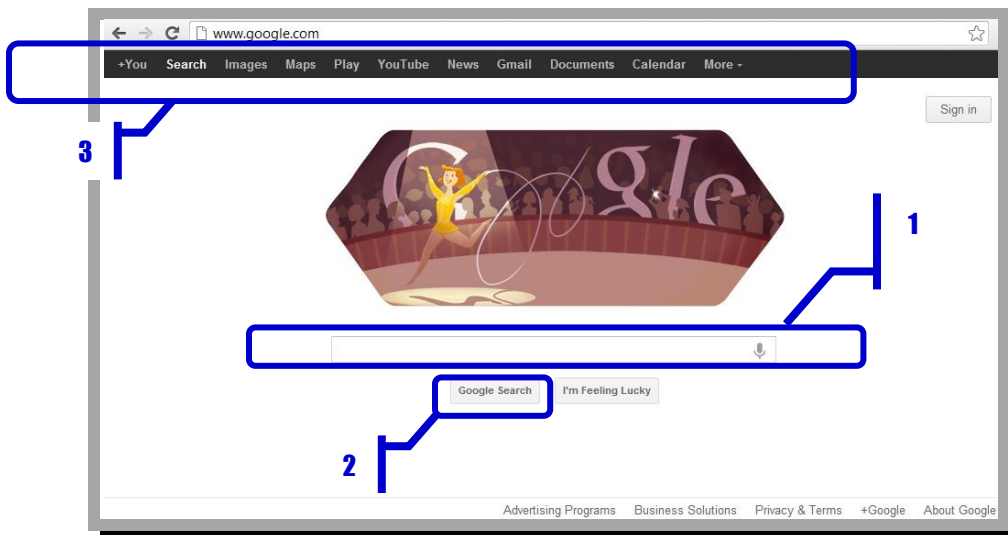
Figure 1. The Google User Interface

Google's "free" and easy-to-use Internet search service begins with a very familiar user interface (or home page). Using a web browser such as Google Chrome®, Mozilla Firefox®, Internet Explorer®, or Safari®, the web address, www.Google.com , is entered as shown in Figure 1. By entering a keyword (or phrase) in the search box (section 1) and clicking the "Google Search" button (section 2), a basic user-initiated search can be requested. In addition to using the Google home page to search relevant results on the World Wide Web, users are also able to perform specific searches (i.e., You, Search, Images, Maps, Play, YouTube, News, Gmail, Documents, Calendar, and More) by clicking the links located at the top of the Google page (section 3).