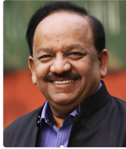
Dr. Harsh Vardhan