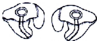
Right and left earmolds

The ear mould is a plastic or silicone insertion designed to conduct the amplified sound from the hearing aid receiver into the ear canal and to the tympanic membrane.