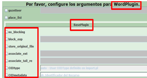
Fig. 2. Lack of detail on format configuration panel