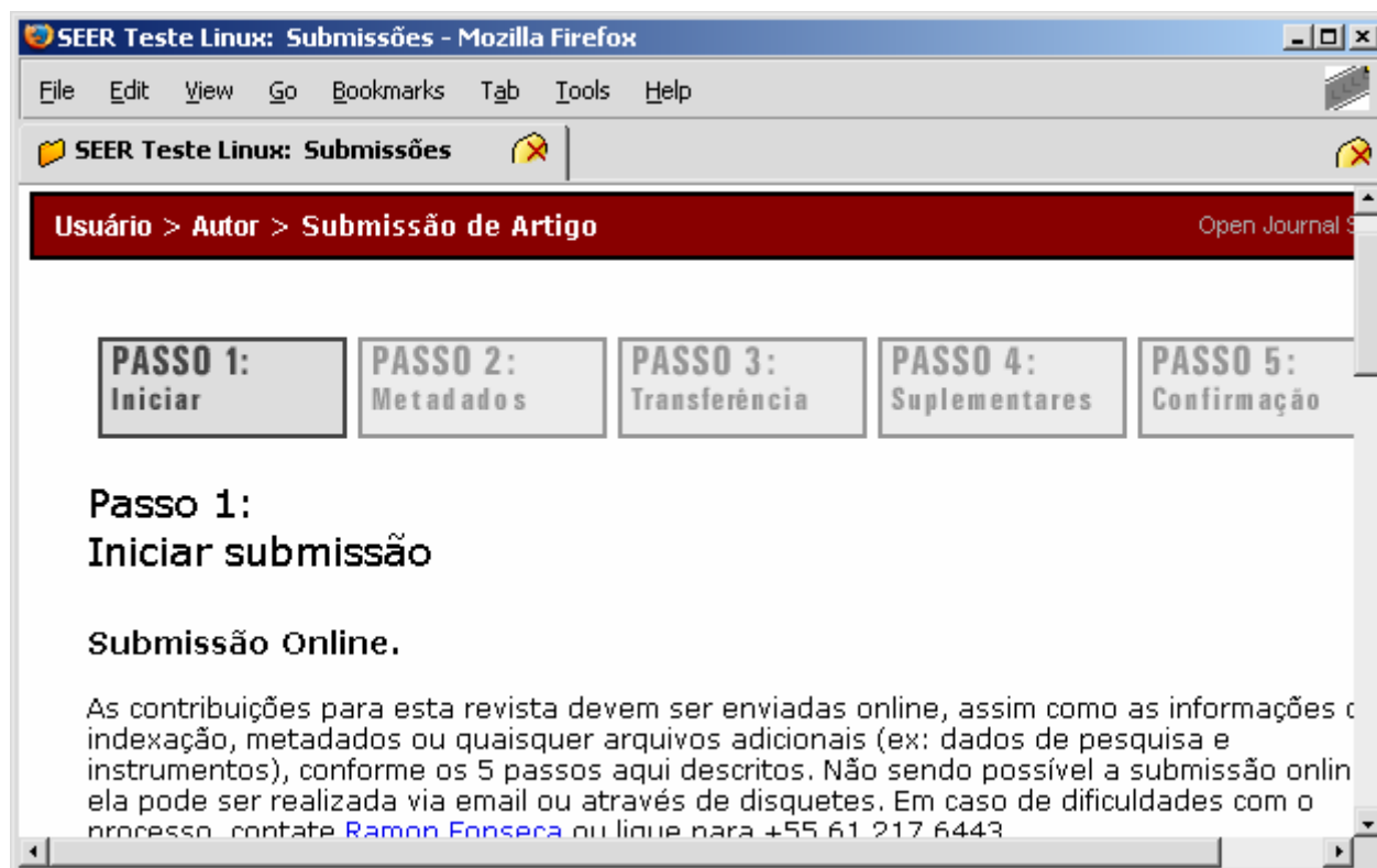
FIGURE 3 – AUTHOR SUBMISSION STEPS TRANSLATED INTO PORTUGUESE

The use of images with type is a risk factor for multilingual systems. The need to recreate those images according to the language may encounter several barriers, such as unavailable fonts, lack of template files for editing, or even the difficulty in finding someone capable for the task. Programming Languages, such as Perl, PHP and Java are capable of creating dynamic images; however, the length of text may alter image design, as well as the page and system graphic design, conveying an amateurish look to the system.