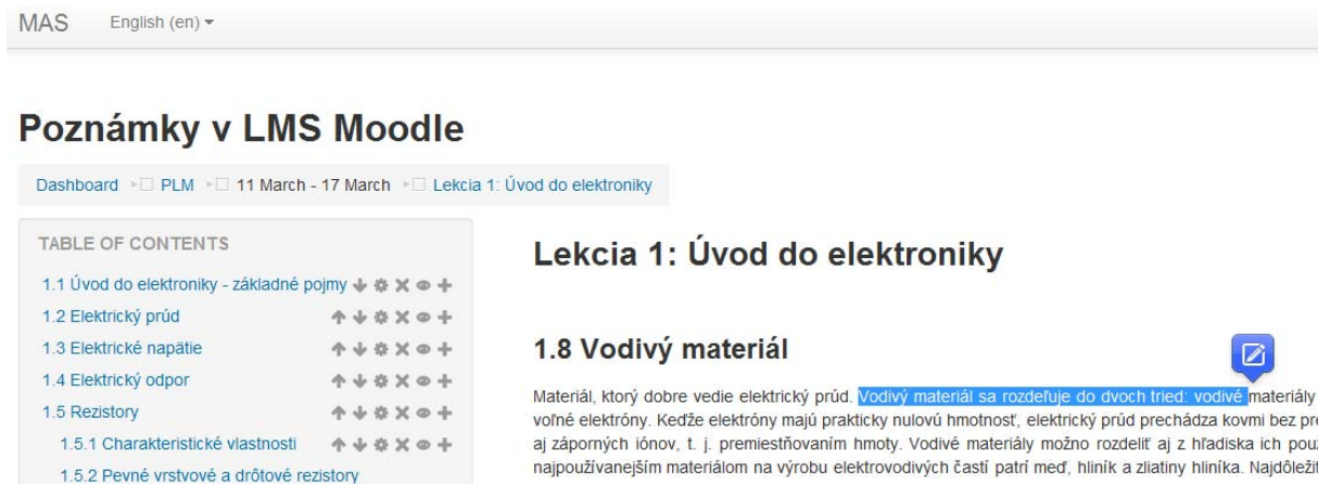
Figure 3: Select text in study material with the possibility of add comments.

For to use this module Notes, we must activate its function through select Add Block - Notes. In this step is then possible to use the module for addition of comments such as similarly in Microsoft Word.