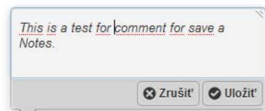
Figure 4: Comments box with added comment.

Materiál, ktorý dobre vedie elektrický prúd. Vodivý materiál sa rozdeľuje do dvoch tried: vodivé materiály prvej triedy - kovy a vodivé ma voľné elektróny. Keďže elektróny majú prakticky nulovú hmotnosť, elektrický prúd prechádza kovmi bez premiestňovania hmoty. Naproti to aj záporných iónov, t. j. premiestňovaním hmoty. Vodivé materiály možno rozdeliť aj z hľadiska ich použitia na elektrovodivé materiály najpoužívanejším materiálom na výrobu elektrovodivých častí patrí meď, hliník a zliatiny hliníka. Najdôležitejšou vlastnosťou týchto kovov na prvé miesto zaraďuje striebro, potom meď, zlato a hliník. Použitie zlata a striebra je obmedzené len na zvláštne účely.