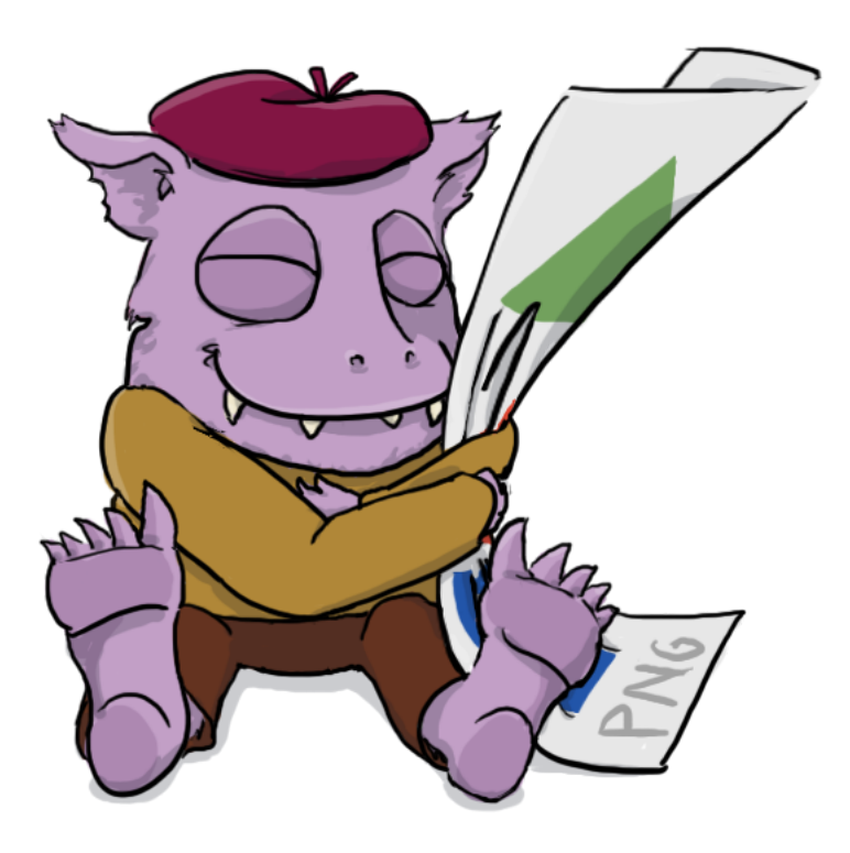
Fig. 2: Figure 2: Snuggly goblin. Illustrated by Karen Rustad