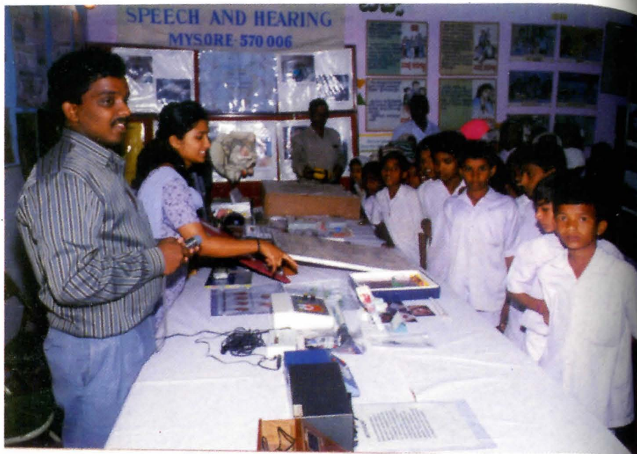
Students are explaining speech and hearing problems to a group of school children in an exhibition during Dasara festival.