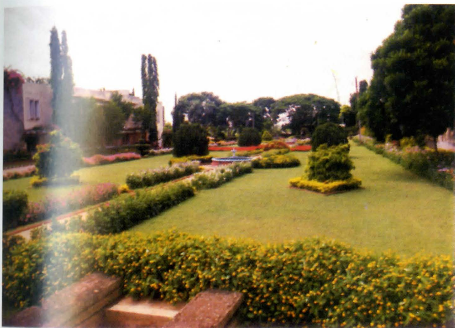
A panoramic view of the institute garden.