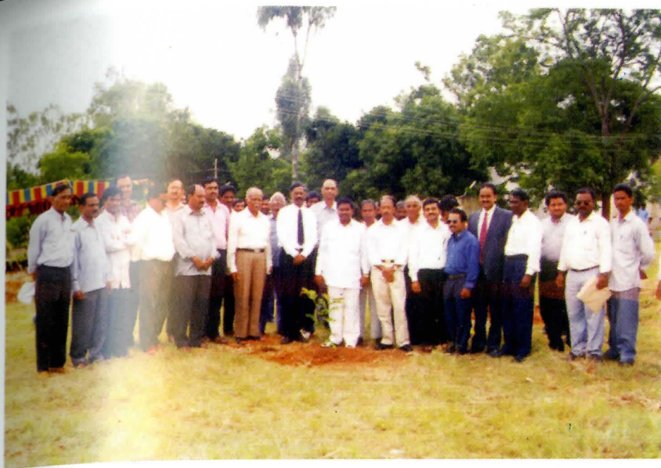
The Chief Guest, Director and other staff members are seen on the occasion of laying of foundation stone for the new library and information centre.