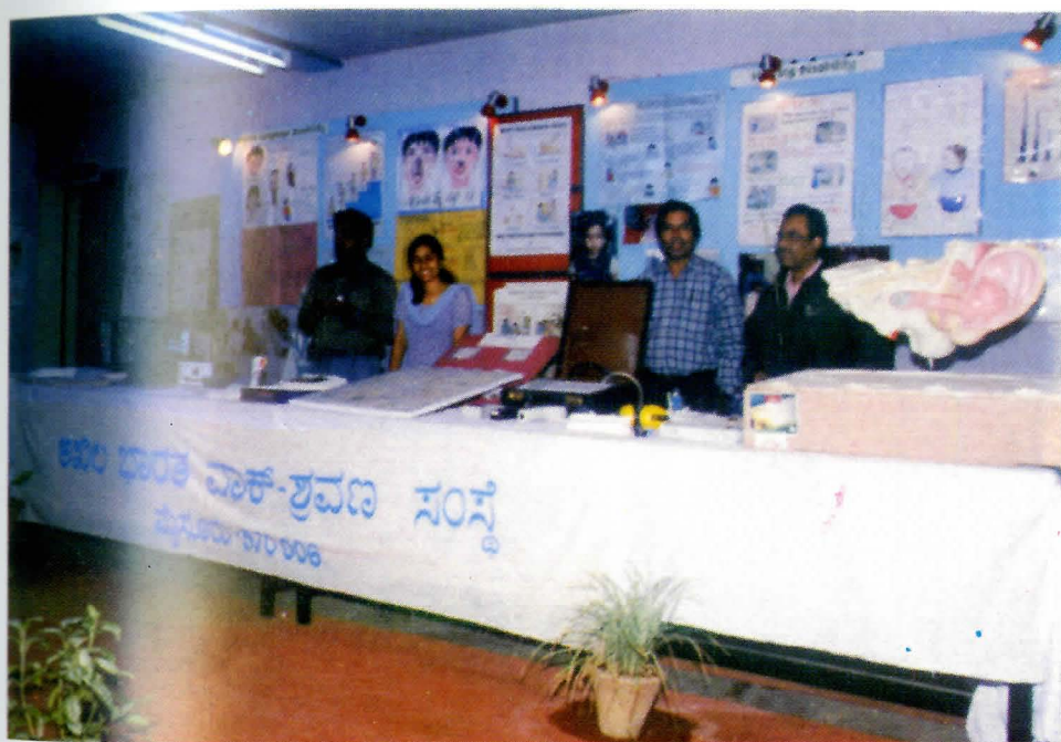
A view of the stall organised by AIISH during Dasara Exhibition.