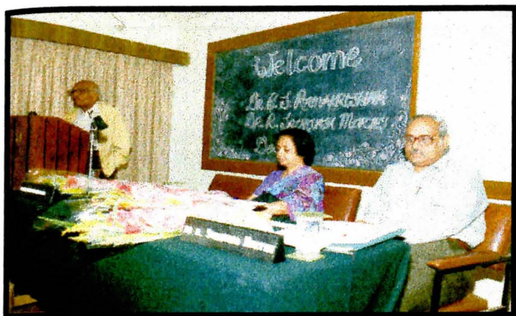
Inauguration of the workshop on "Optimum Student-Teacher Ratio in the field of Speech & Hearing"