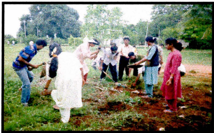
Students involved in NSS activities