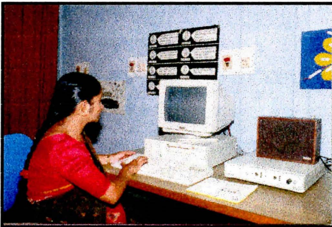
Computerized Speech / Language analysis