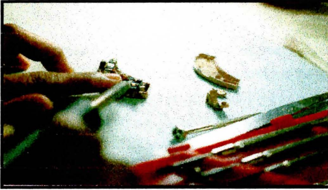
Hearing aid servicing