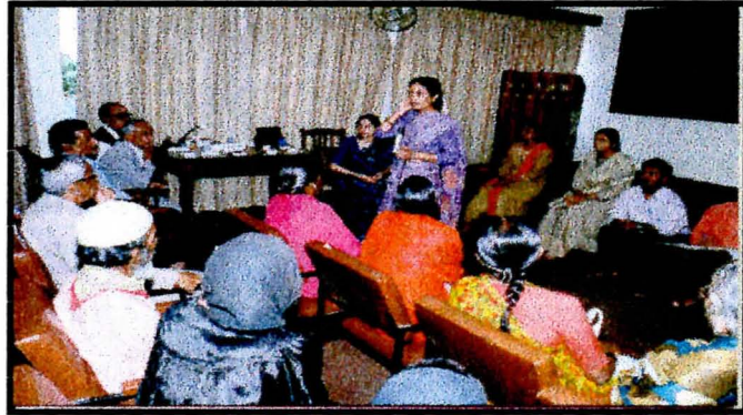
Hearing aid users' camp